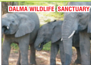
DALMA WILDLIFE SANCTUARY