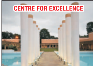
CENTRE FOR EXCELLENCE